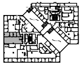
KEY PLAN SCALE: N.T.S.