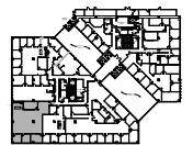
KEY PLAN SCALE: N.T.S.